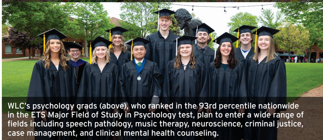
WLC's psychology grads (above), who ranked in the 93rd percentile nationwide in the ETS Major Field of Study in Psychology test, plan to enter a wide range of fields including speech pathology, music therapy, neuroscience, criminal justice, case management, and clinical mental health counseling.