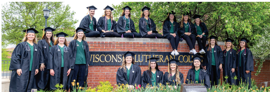
The WLC Class of 2022 was comprised of students from 20 states representing 41 academic programs. WLC's 18 nursing grads (above) will begin serving in healthcare settings this summer while preparing to take the NCLEX exam.