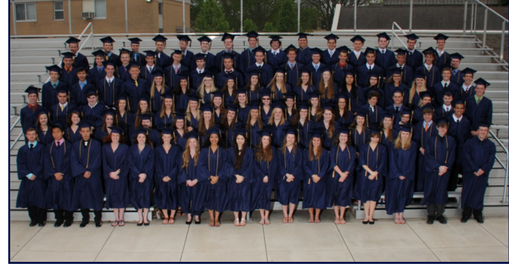
The 100 members of the Luther Preparatory School Class of 2015 officially completed their high school training on May 23, 2015. The achievement was commemorated with a service of thanksgiving in the Luther Prep gymnasium.

May 23, 2015, Luther Preparatory School graduation day. Luther Prep graduation day marks the culmination of the first phase of preparation for the public ministry of the Gospel. That first phase is the beginning of an eight, nine, or twelve year program of training for a Prep grad. At the end of the journey they will have attended MLC for four or five more years to become Lutheran elementary school teachers, high school teachers, or staff ministers. Those men from the LPS Class of 2015 who continue their preparation for the pastoral ministry will continue for four more years at WLS. This year's graduating class is a landmark one. The 100 young men and women comprise the 20th graduating class from Luther Preparatory School and the 150th class to graduate on this historic campus. Of this class 53 have indicated that they will continue at MLC. 26 of its number will continue in the pastor track, 26 have plans to become teachers, and one will enter the staff ministry program. Classmates who have made other plans for their future have been prepared each day for the last four years to enter the world as future consecrated and dedicated laymen and women of their congregations. These 100 young men and women will continue the tasks of lives prepared for service that will support the public ministries of their 53 classmates. Pray for them as they continue the tasks of service.