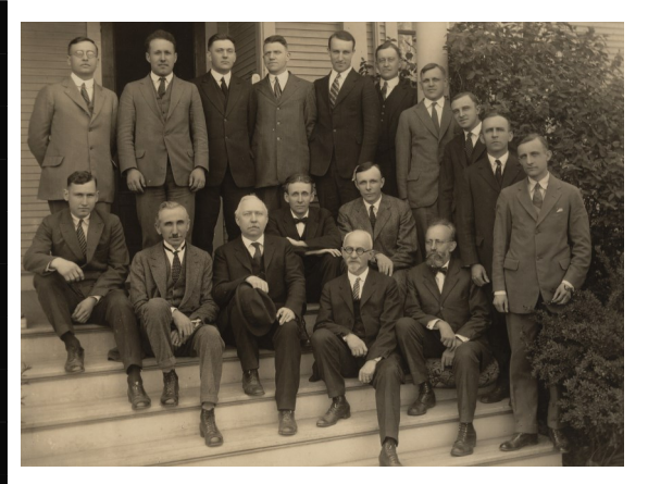
FACULTY OF 1925