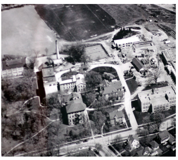
AERIAL VIEW OF CAMPUS IN 1931