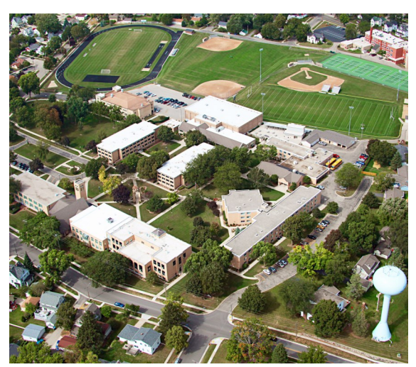
AERIAL VIEW OF CAMPUS IN 2015