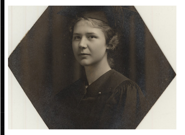
GRADUATION DAY 1915