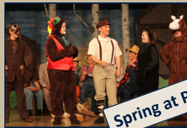
Spring at Prep