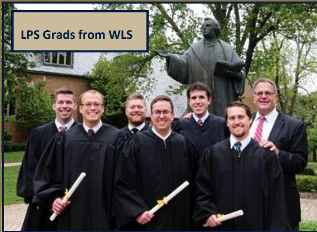
LPS Grads from WLS