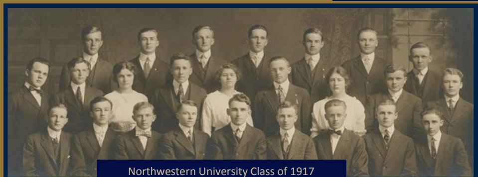
Northwestern University Class of 1917

May 20, 2017 was LPS graduation day. This marks a high point in the first phase of preparation for the public Gospel ministry. That first phase is the beginning of an eight, nine, or twelve year program of training for a Prep grad. At the end of phase two 25 will have attended MLC for four or five more years to become Lutheran elementary or high school teachers, or staff ministers. The 13 men from the LPS Class of 2017 who continue their preparation for the pastoral ministry will go on for four more years at WLS. Classmates who have made other plans for their future have been prepared each day for the last four years to enter the world as future dedicated laymen and women of their congregations. Pray for all of them as they continue the tasks of service that lie ahead of them.