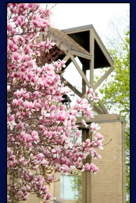
PHOTOS TOP LEFT-GRATEFUL BEASTS, SOFTBALL, SPRING, APRIL ARBOR DAY, TOP 11 TERTIANERS, GALA XII