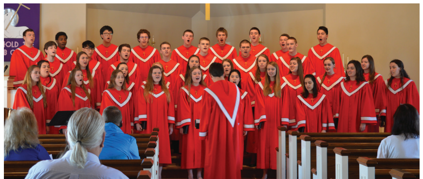
Concert Choir - 2017 East Coast Mid-Atlantic Tour