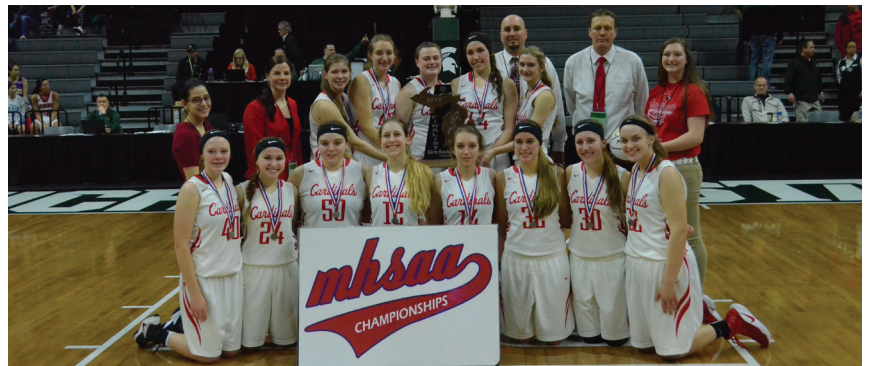
2017 Girls' Class D State Final Runner Up