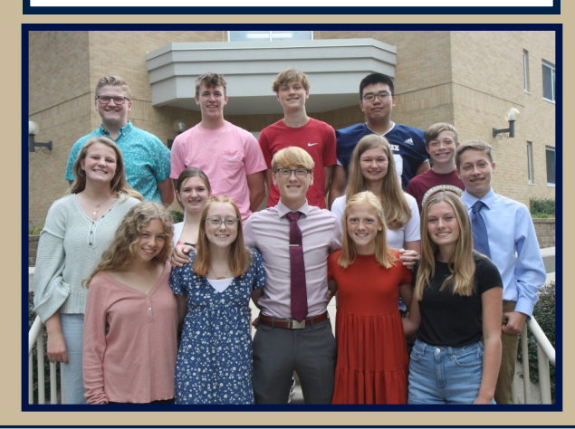
Above are the students from the Chicago Conference and below are Shoreland Conference students at LPS.