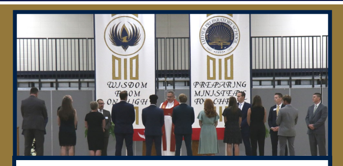
New faculty installation during the opening service