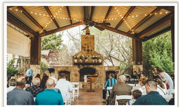
Divine Peace—Rockwall, Tex., campus

The multi-site church movement is all about reaching more people with the gospel—and this new strategy has already been blessed with success in many WELS congregations. Having one church in several locations allows congregations to reach different communities while enjoying practical benefits such as shared resources, efficient organization, and cost-effective programs. Home Missions currently supports 23 congregations that are part of multi-site ministries. To learn more about how your congregation might benefit from a multi-site ministry, consider attending the WELS National Multi-Site Conference. Visit wels.net/missions for more information.